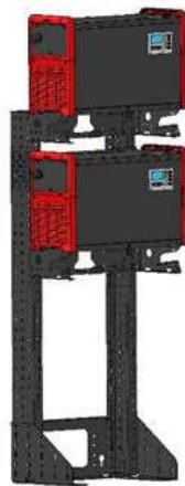
Setup for 2 battery charging systems