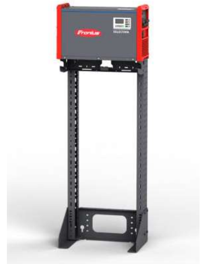
Representative image of the Charging Rack Easy

The user can also mount Selectiva 1kW, 2kW and 3kW battery charging systems on the charging rack using an optional mounting plate.